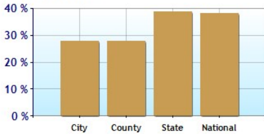
Future Job Growth