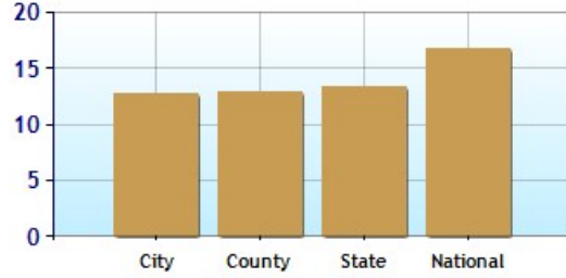
Students per Teacher